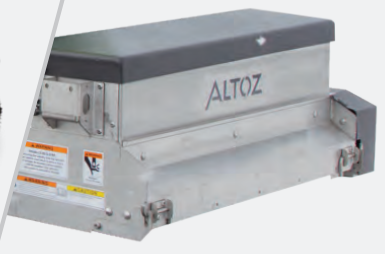
DROP SPREADER ▼