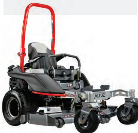
XP 610 RDi