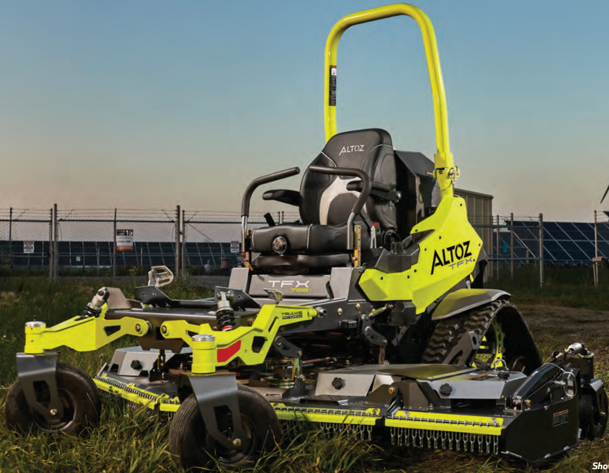
Shown with optional Deck Extension and Track Fenders