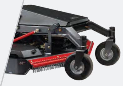
44" & 61" HV ALL-TERRAIN DECK ▼