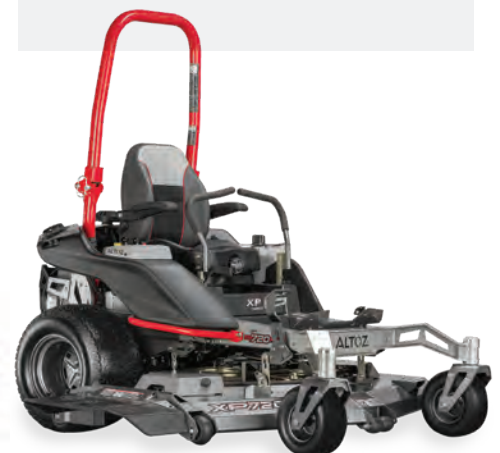
XP HD SERIES