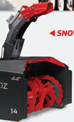
← SNOW BLOWER