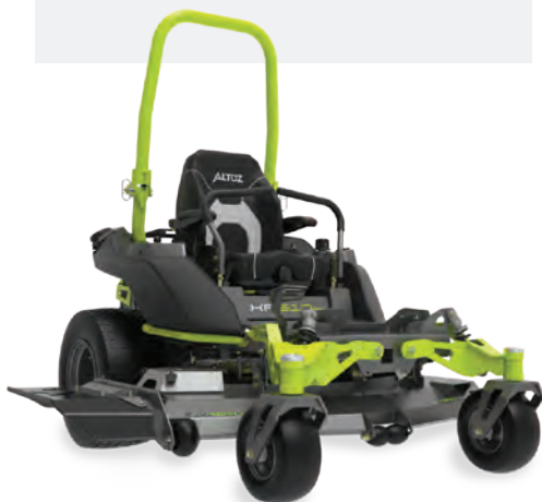
XP 610 SSi