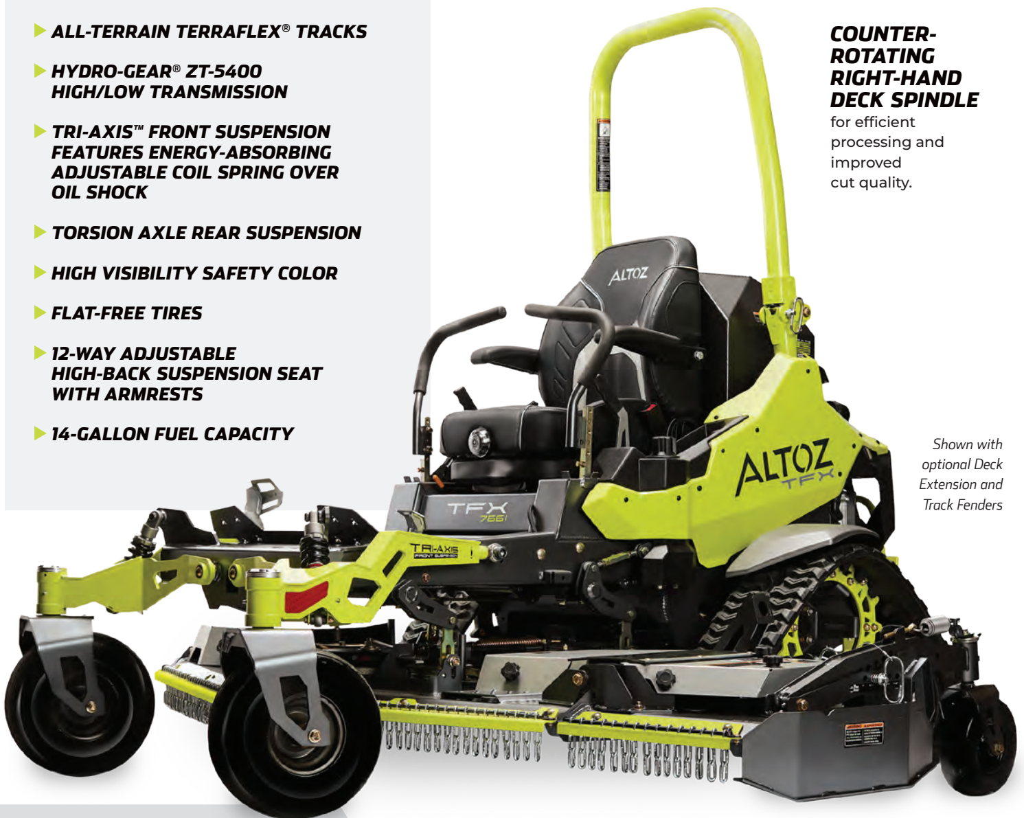
Shown with optional Deck Extension and Track Fenders

for efficient processing and improved cut quality.