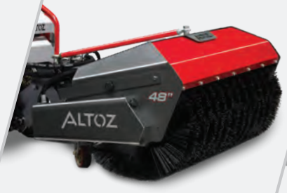
POWER ANGLE BROOM ▼