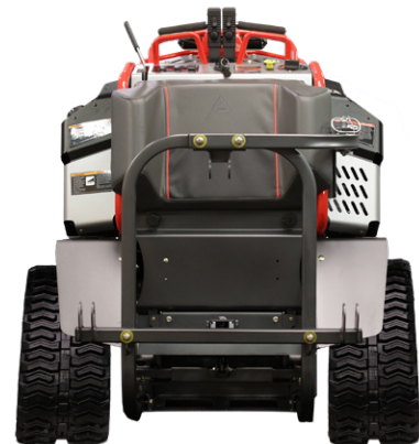
Widening Kit Installed on Switch