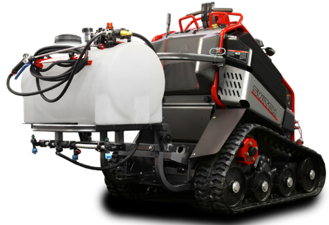
Shown with 4' Wide Spray Pattern Boom, sold separately