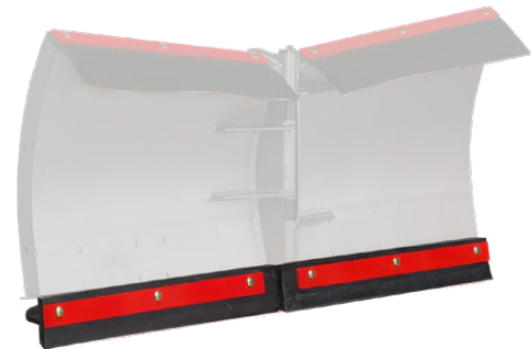
Non-Marring Cutting Edge shown on V-Plow (p/n 1060000)