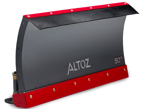
Straight Blade - Shown with Snow Flap Kit (p/n 2500726)