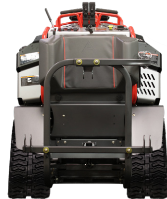
Standard Switch Width