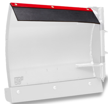
Snow Flap Kit shown on V-Plow (p/n 1060000)