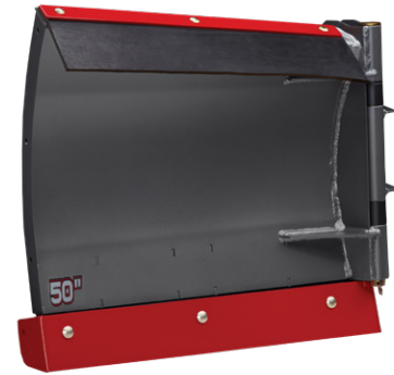
V-Plow - Shown with Snow Flap Kit (p/n 2500725)