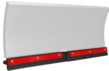
Non-Marring Cutting Edge shown on Straight Blade (p/n 1060001)