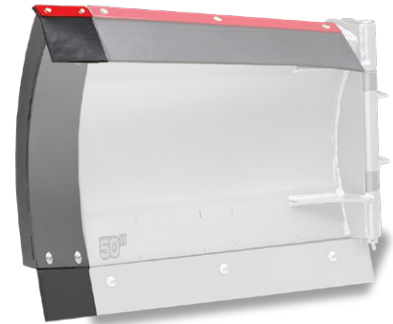
Extension Kit shown on V-Plow (p/n 1060000)