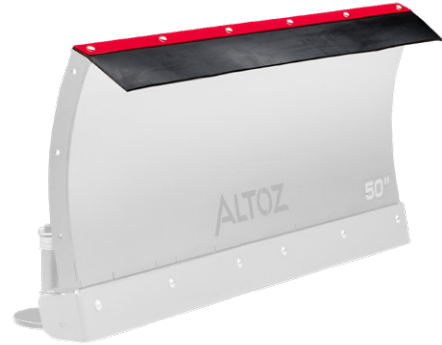
Snow Flap Kit shown on Straight Blade (p/n 1060001)