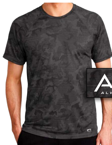
Screen printed on left sleeve