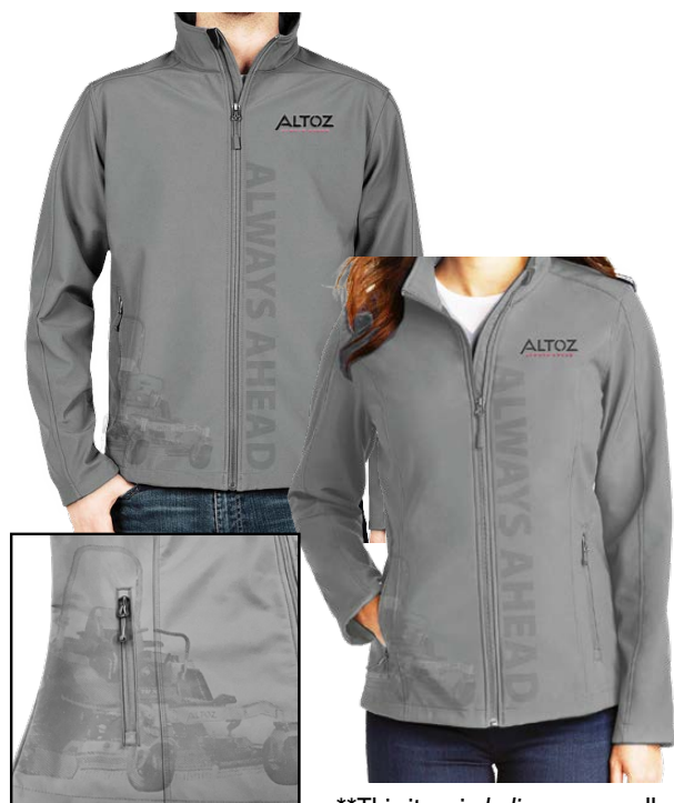
Close-up of laser etching on front of jacket

**This item in ladies runs small ordering one size up is recommended.