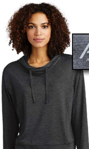
Heat-pressed Altoz logo on left sleeve

9500379 (S-X) .....$33.00 9500379 (XXX) .....$35.50