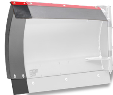
Extension Kit shown on V-Plow (p/n 1060000)