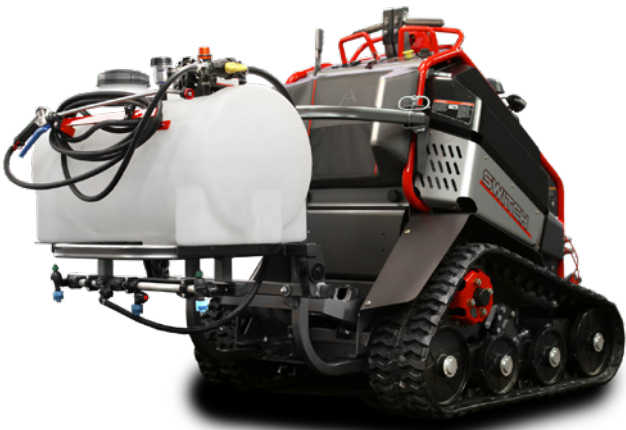
Shown with 4' Wide Spray Pattern Boom, sold separately