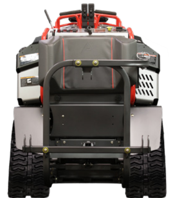
Standard Switch Width