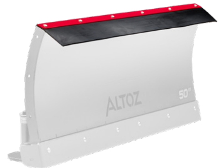
Snow Flap Kit shown on Straight Blade (p/n 1060001)