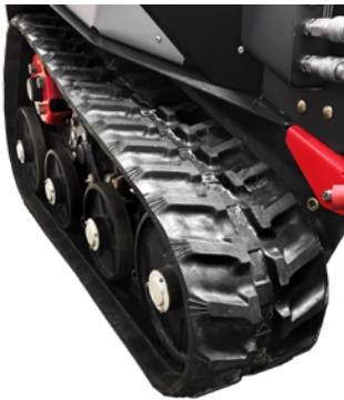
TerraFlex Track, T-Tread Pattern, p/n 5500099