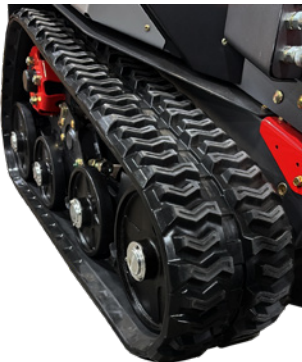
TerraFlex AT Track, Z-Lug Tread Pattern, p/n 5500113