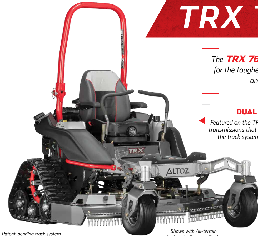
Patent-pending track system

TorqFlex front suspension delivers stability, a smooth ride and reduces operator fatigue. Standard on TRX 766 and 561.