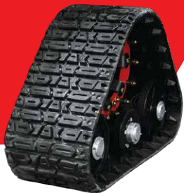
Optional Turf Tracks

All-terrain Tracks are ideal for side hilling, mud and rough areas other mowers can't reach. Optional Turf Tracks are less aggressive and perfect for soft ground, rolling hills and sensitive terrain.